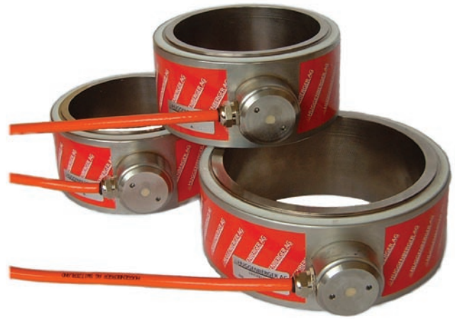
Load cells PRE

Strain gauges are applied in a temperature compensated arrangement directly on a thermally treated